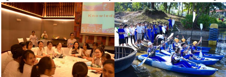
Figure 4. Career Orientation and Recruitment Day at Laguna Langco Resort

- Co-curricular activities: students are supposed to either participate in a 5-day tour or stay 1 night in a 5-star hotel. This activity is required to complete before graduation.