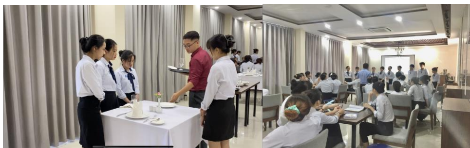
Figure 1: Teaching-learning activities in the Lab named DUE Hotel

Students will have the opportunity to experience their learning with highly qualified and experienced faculty. They will be actively involved in learning activities through competency-based and practical teaching methods such as Project-Oriented Learning, Jigsaw, Peer assessment ( Peer Grading), Practical Teaching (Work-based Learning), Simulation (Simulation)... The tourism implementation area will give learners a simulated learning environment like a 4-star hotel.