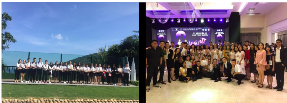
Figure 5. Field trip at Intercontinental Danang Sun Peninsula Resort and Lovely Night

- Co-curricular activities: students are supposed to either participate in a 5-day tour or stay 1 night in a 5-star hotel. This activity is required to complete before graduation.