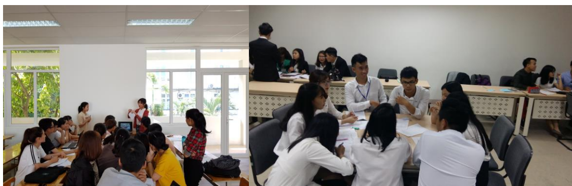
Figure 1: Peer Grading and Discussion

Students will have the opportunity to experience their learning with highly qualified and experienced faculty. They will be actively involved in learning activities through competency-based and practical teaching methods such as Project-Oriented Learning, Jigsaw, Peer assessment ( Peer Grading), Practical Teaching (Work-based Learning), Simulation (Simulation)... The tourism implementation area will give learners a simulated learning environment like a 4-star hotel.