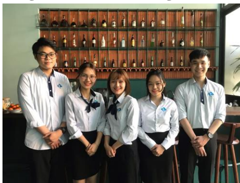
Figure 2. Field survey in Memory Hostel for Project-Oriented Learning