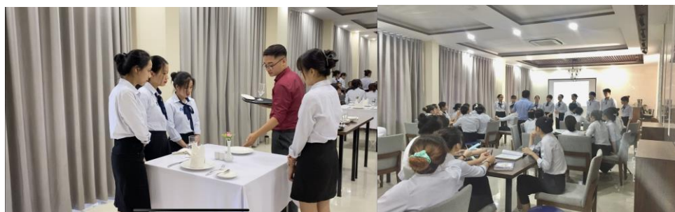
Figure 1: Teaching-learning activities in the Lab named DUE Hotel

Students will have the opportunity to experience their learning with highly qualified and experienced faculty. They will be actively involved in learning activities through competency-based and practical teaching methods such as Project-Oriented Learning, Jigsaw, Peer assessment ( Peer Grading), Practical Teaching (Work-based Learning), Simulation (Simulation)... The tourism implementation area will give learners a simulated learning environment like a 4-star hotel.